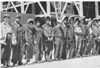
Black shipyard workers in Marin City during World War II.

And in Marin, there is no more fitting place to begin than at Golden Gate Village in Marin City.