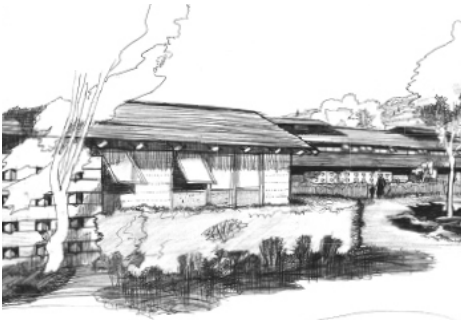
Detail from an Aaron Green sketch for Golden Gate Village.

Upon completion in 1961, Golden Gate Village’s 300 units were quickly filled by low-income residents, many of them African-Americans relocated from demolished Marinship housing. It was an active, inter-generational community - and the only public housing project in Marin (then and now) that accepted families and children.